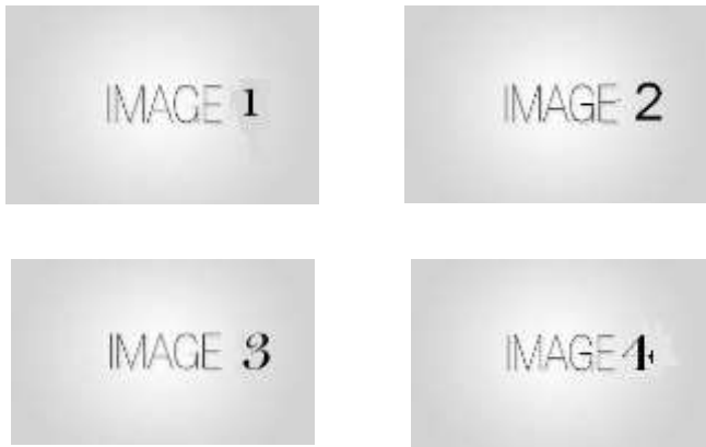
Figure 3: The layout of multipart images should be as per the above example within the table. All images must have the “Image” style applied.